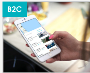
Product stories Product traceability Supply chain transparency